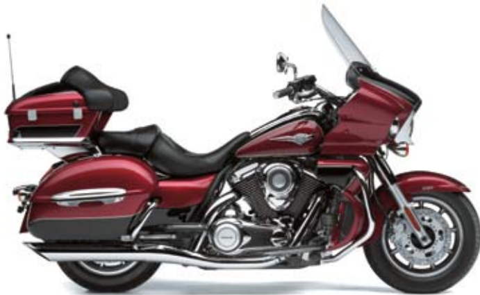
METALLIC DIABLO BLACK / METALLIC IMPERIAL RED