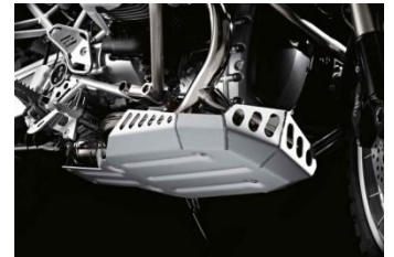
Enduro aluminium engine guard