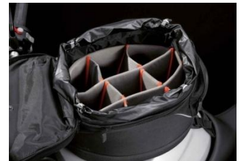
Vario insert tank rucksack