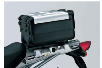
Mounting parts for Topcase instead of rear seat