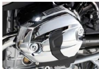
Cylinder-head cover, chrome