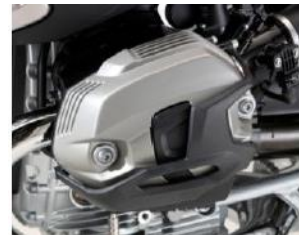
Plastic cylinder-head cover guard