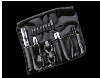
On-board toolkit service kit