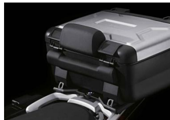
Vario topcase + Backrest pad