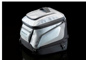
Softbag 2 small