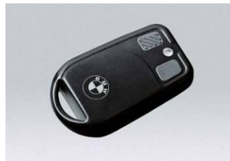
Anti-theft alarm system