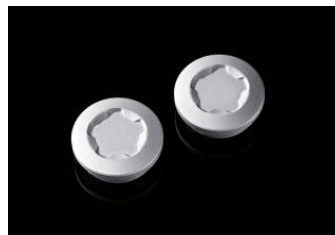
Set of caps, fork bridge / Telelever cover cap