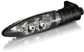
LED flashing turn indicators