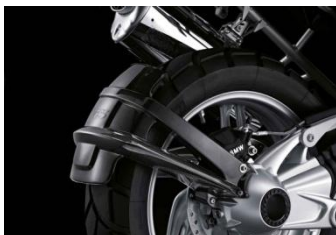
Carbon spray guard, rear