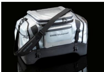
Softbag 2 large