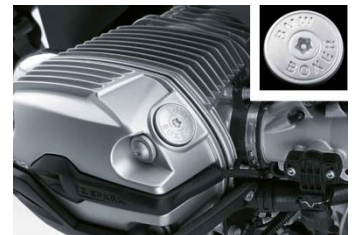
Safety plug for oil filler neck