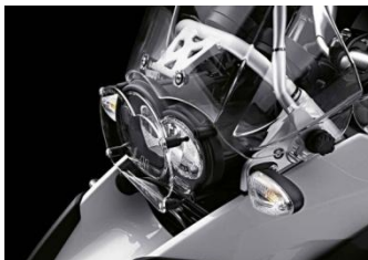
Headlight guard (for off-roading only)