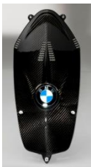
HP Carbon cover for engine block