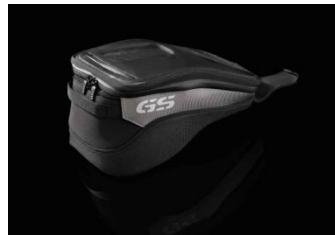
Tank rucksack small