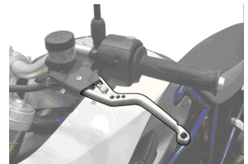
Handlebar lever, milled