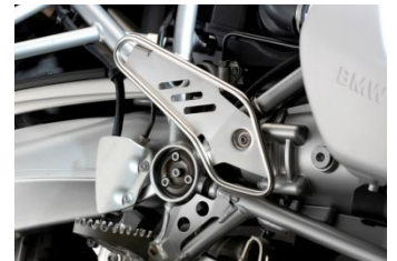
Frame guard, special steel