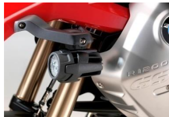
LED auxiliary headlight