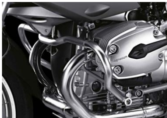
Crash bar, special steel