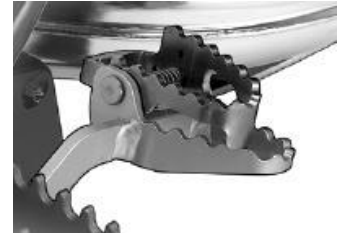
Footbrake lever, adjustable