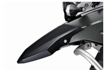
Extension for wheel cover