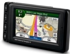
BMW Motorrad Navigator IV