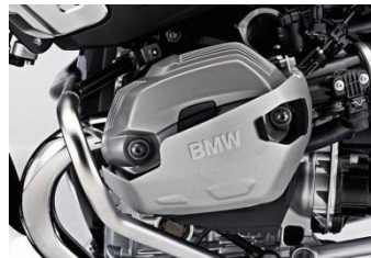
Aluminium cylinder-head cover guard