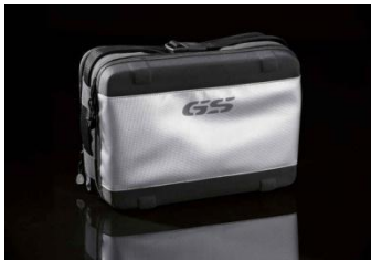
Liner for Vario case / Vario topcase