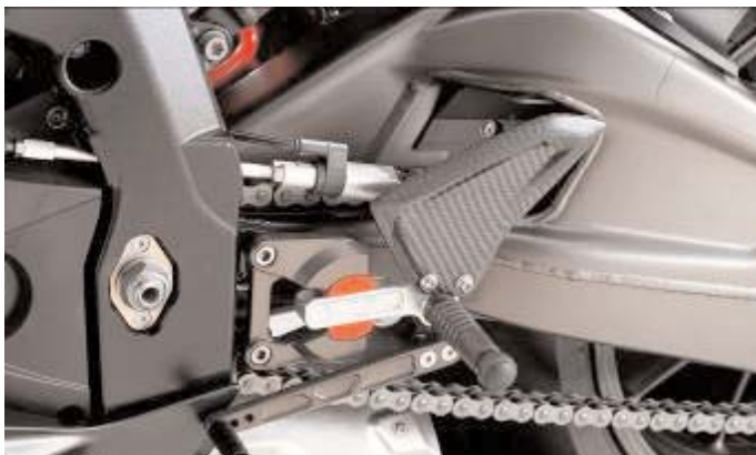
HP Footrest system