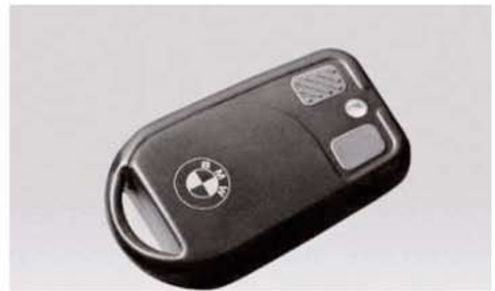
Anti-theft alarm system