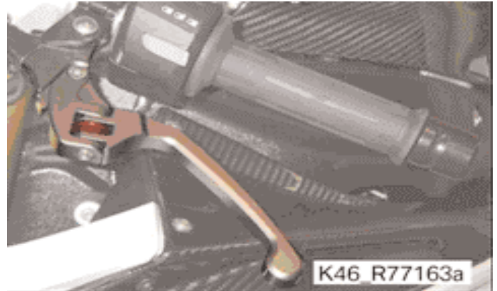
HP brake lever / HP clutch lever, hinged