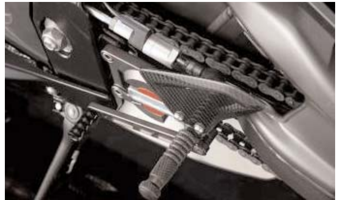
HP shift assistant