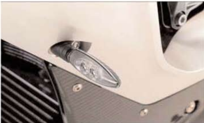
LED turn signals