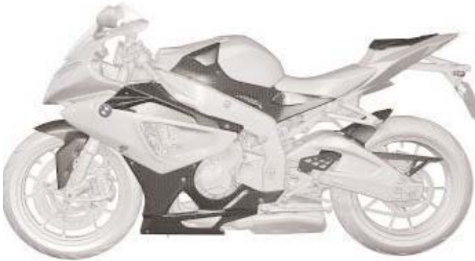
HP CarbonMounted parts